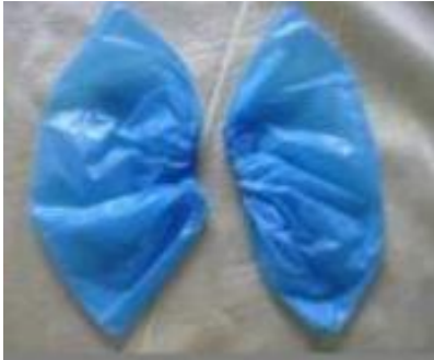
Disposable CPE Shoe Cover