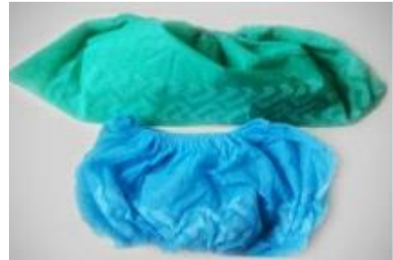
Disposable Non-Woven Anti-Slip/ Non-Skid Shoe Cover