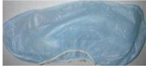
Disposable PP Non-Woven Shoe Cover