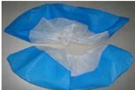
Disposable Non-Woven Anti-Slip/ Non-Skid Shoe Cover